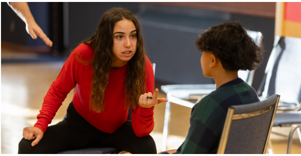
Photographer John Chan, The Exchange Workshops