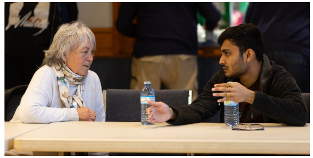
Photographer John Chan, The Exchange Workshops